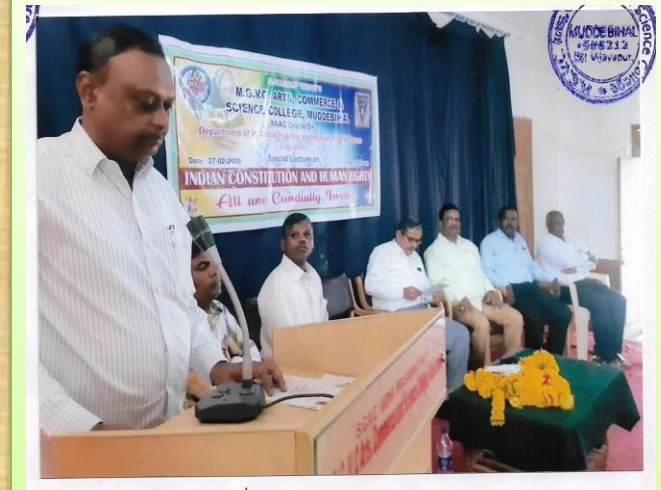
ilomovalla contrat al a contrat